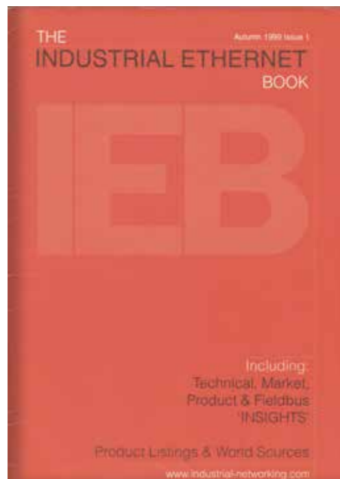
First issue of Industrial Ethernet Book, 1999

Industrial Ethernet Book still is the respected trip advisor for the journey to the Industrial Internet of Things.